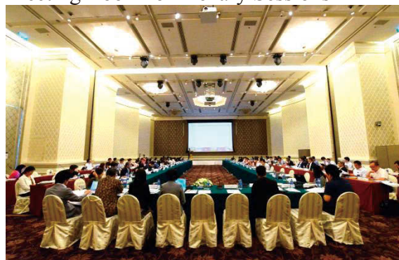
Meeting Room for Plenary Sessions